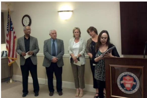
Retirement reception at the Smittcamp Alumni House