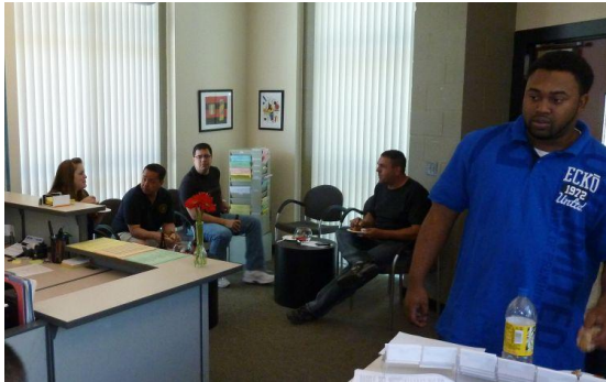
Downtown Program students